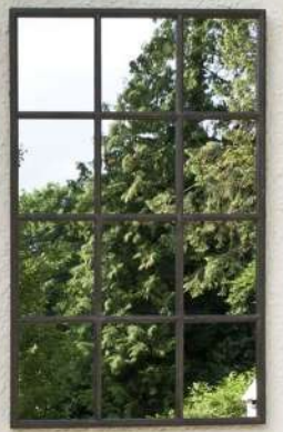
18 MIRRORS TO WALLS