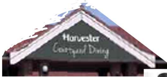
2 HARVESTER SIGNAGE TO EXISTING WALL AT HIGH LEVEL