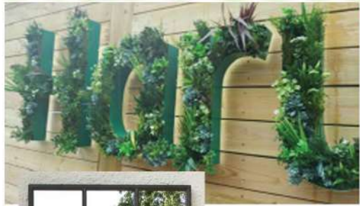
19 FEATURE HARVESTER "PLANT" SIGNAGE TO WALL BACK LIT