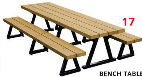
17 BENCH TABLES