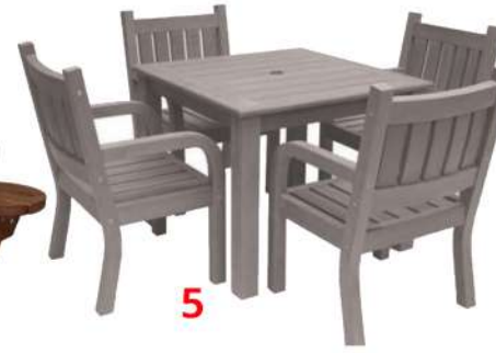
5 LOOSE FURNITURE