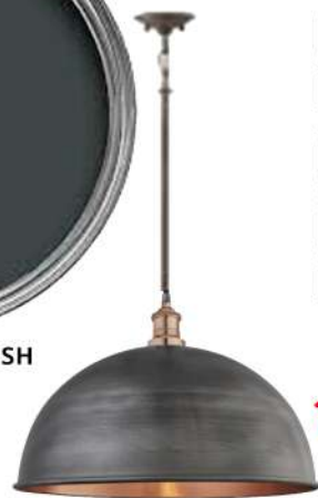
14 FEATURE PENDANT