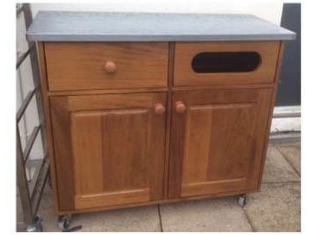
7 WAITRESS STATION