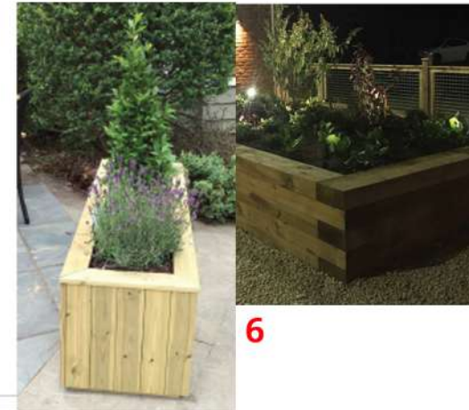
6 TIMBER PLANTERS BETWEEN COLUMNS