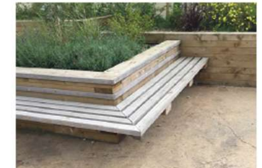
12 IROKO SEATING TO INNER PERIMETER OF COURT YARD AND AROUND CENTRAL TREE FEATURE