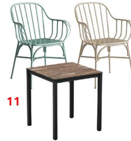
11 CELLINI ARM CHAIRS & EXTREMA TABLES