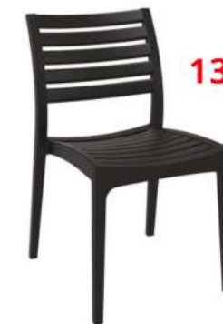
13 BLACK DINING CHAIR & TABLE WITH PEDESTAL BASE