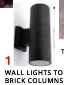
1 WALL LIGHTS TO BRICK COLUMNS