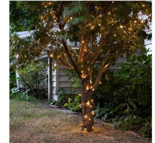
10 TWINKLE LIGHTS TO NEW TREE FEATURE, CENTRAL TO COURTYARD