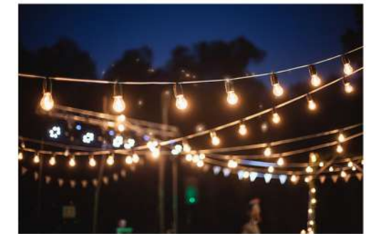
9 FEATURE FESTOON LIGHTING FIXED TO EXISTING LAMPPOSTS AND BRICK COLUMNS