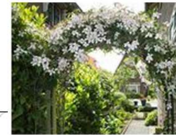
8 PLANTING ARCH BETWEEN COLUMNS LEADING TO COURTYARD AREA