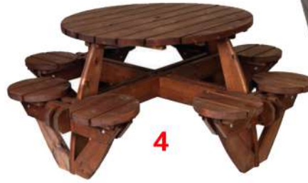
4 ROUND PICNIC TABLES TO TERRACE AREA