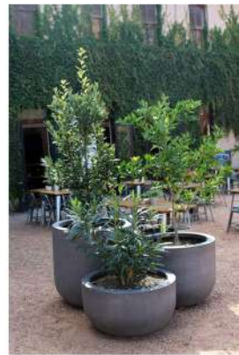
3 PLANTING IN POTS TO CENTRAL ENTRANCE