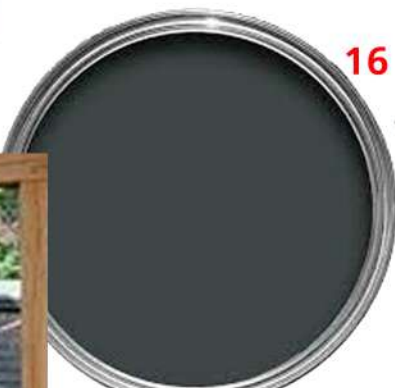
16 GREY PAINT FINISH TO CEILING