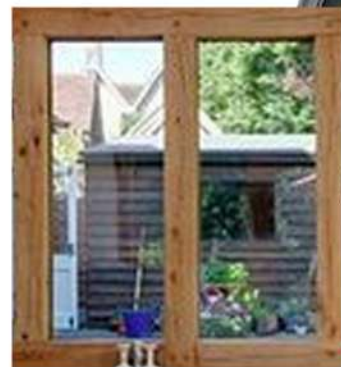
15 NEW OAK FRAMED WINDOWS TO REPLACE EXISTING